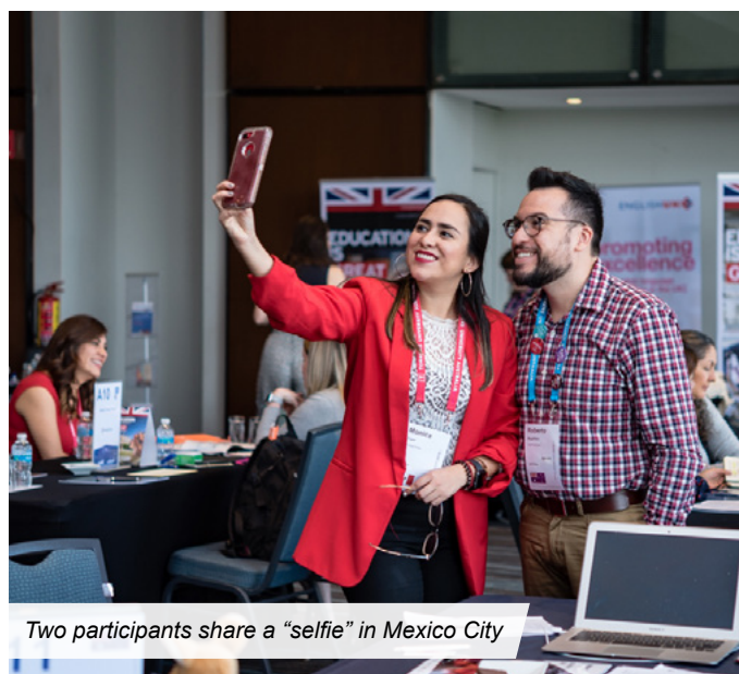
Two participants share a “selfie” in Mexico City