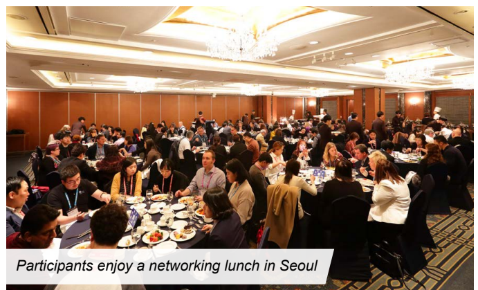
Participants enjoy a networking lunch in Seoul