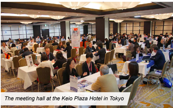
The meeting hall at the Keio Plaza Hotel in Tokyo

The next ICEF Japan-Korea Agent Roadshow will be held from February 25 to 27, 2020, at the Keio Plaza Hotel in Tokyo and the Lotte Hotel in Seoul. Visit https://icef.com/japkor for more information.