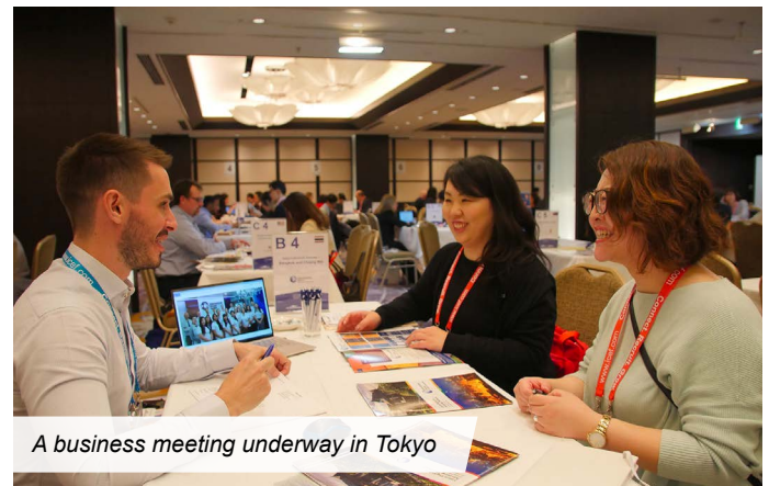
A business meeting underway in Tokyo

The event also welcomed service providers from 10 organisations, of which 13% were first time participants.