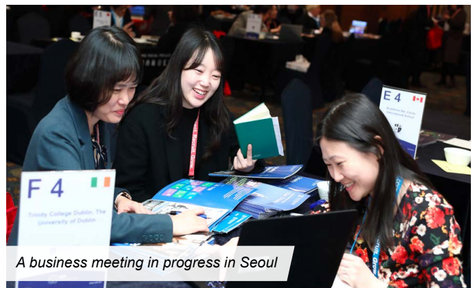
A business meeting in progress in Seoul