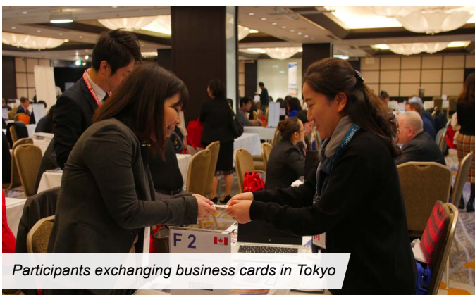
Participants exchanging business cards in Tokyo